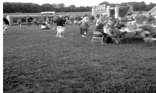
Residents enjoy Family Night in the Park featuring inflatable rides, games and prizes. The evening was highlighted by a mystifying juggling performance and the showing of Willy Wonka and the Chocolate Factory on the big screen.