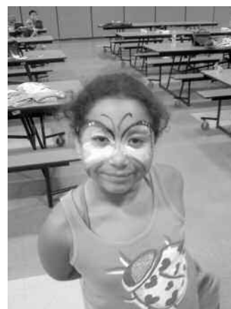
Campers enjoyed face painting at Carnival day at Summer Camp

The Community Bus is used to transport Township residents to and from the East Windsor Township Senior Center, shopping centers and medical appointments. The bus operates Monday through Friday and the second Saturday of each month. Any resident wishing to use the bus should contact the Senior Center to schedule a pick-up time at 371-7192.