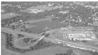
Current aerial view of Interchange 8

T he Turnpike widening project is well under way in East Windsor. At the completion of the project, which the State projects will be in late 2014, there will be a 12-lane dual-dual roadway from Interchange 6 to Interchange 9.